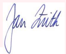
Jan Zeitler Lord mayor of the city of Überlingen

9. Inception of the policy The library policy entries into force on April 15, 2024. Previous terms of use are invalid.